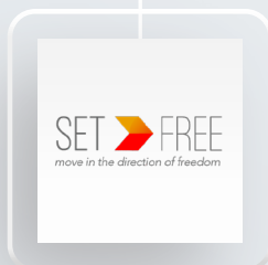
Set Free Movement