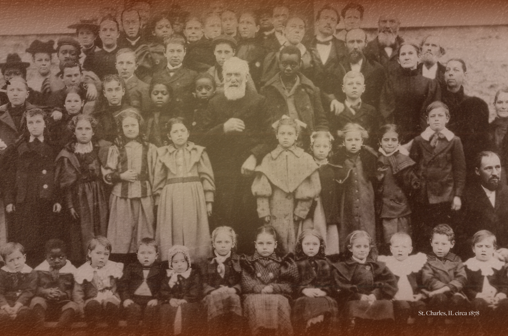
St. Charles, IL circa 1878

Working to preserve Free Methodist heritage and transmit it faithfully to each new generation in order to assist the Free Methodist Church in fulfilling its mission.