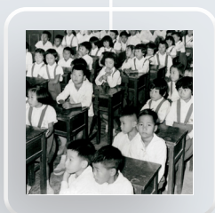
ICCM schools in Hong Kong