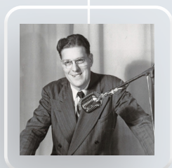
Light & Life Hour Radio Broadcast