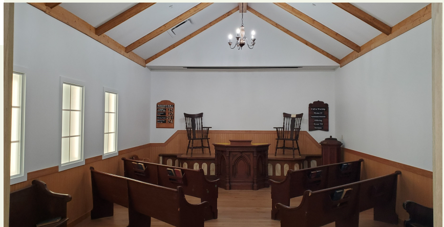
COMMITTEE ON FM HISTORY AND ARCHIVES