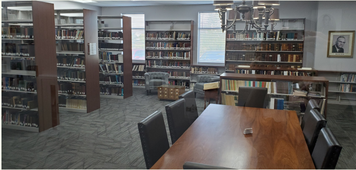
HUGH A. WHITE LIBRARY