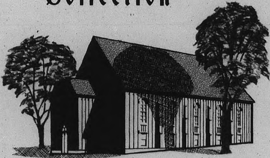
The historic FREE METHODIST CHURCH of Albion, N. Y. Dedicated May 18, 1860—now remodeled and still in use.

The gift of Office of the General Treasurer of the F. M. Church