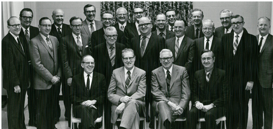
Committee on merger exploration, November 1970

Bishop Marston went on to remark that “while al-